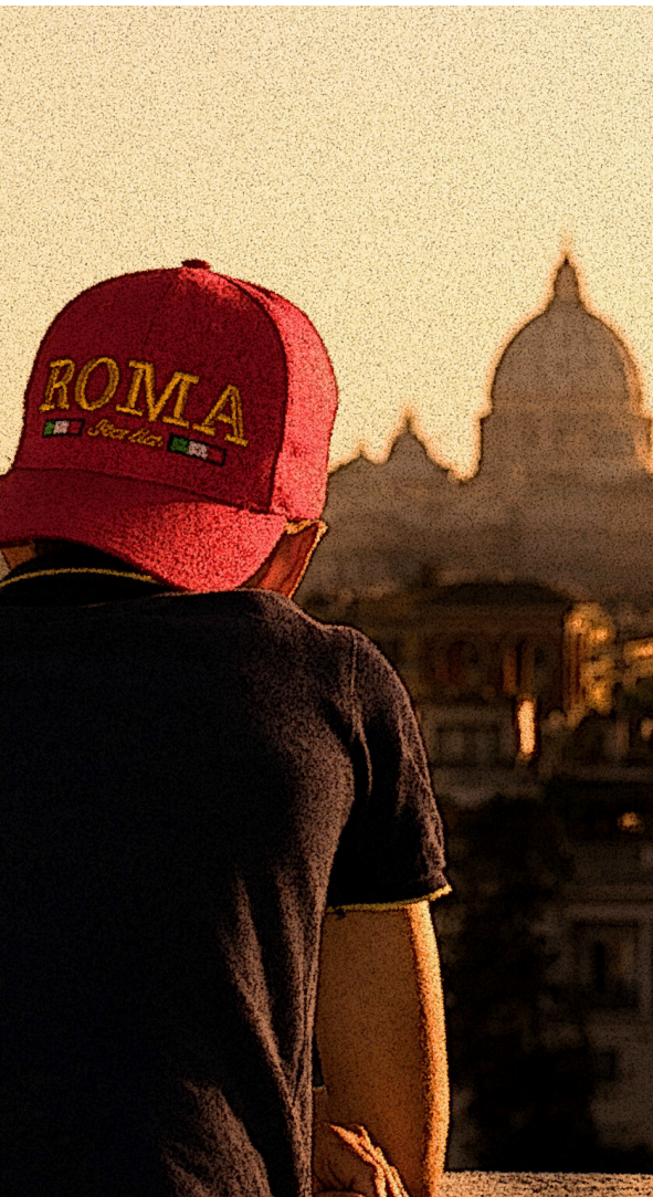
January 2025.